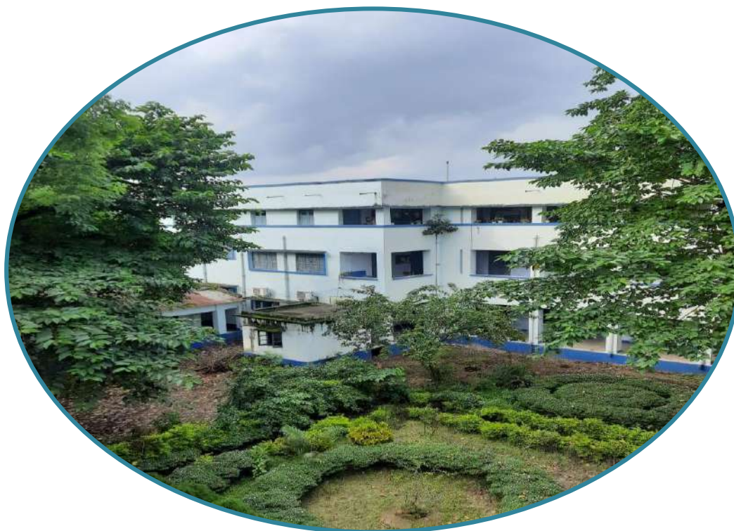
Panoramic view of the college