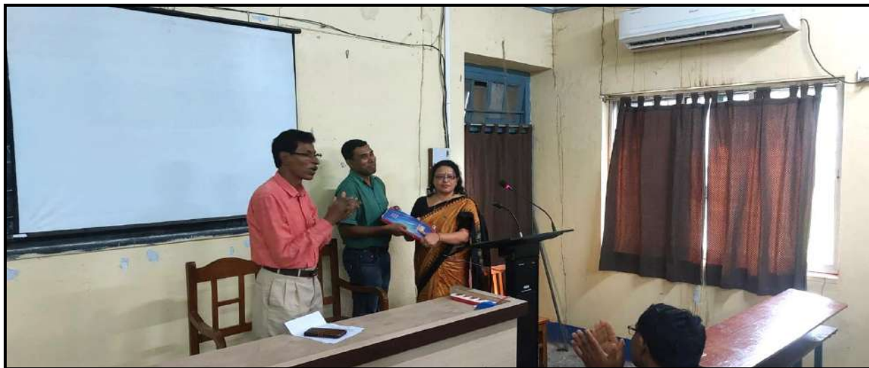
Annual General Meeting held on 30.05.2023