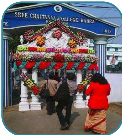
Saraswati Puja Celebration